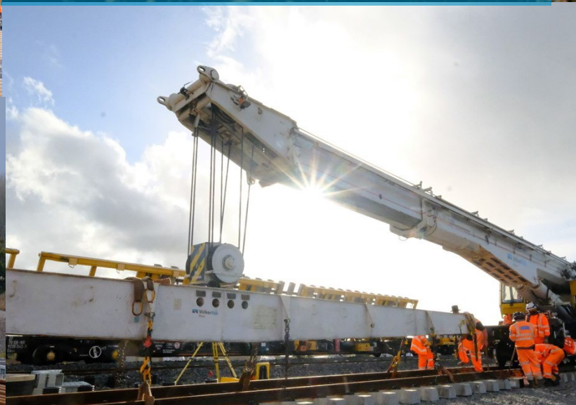
Kirow Crane in Calvert (HS2) Area