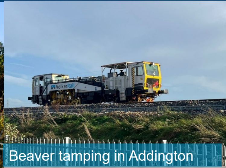
Beaver tamping in Addington