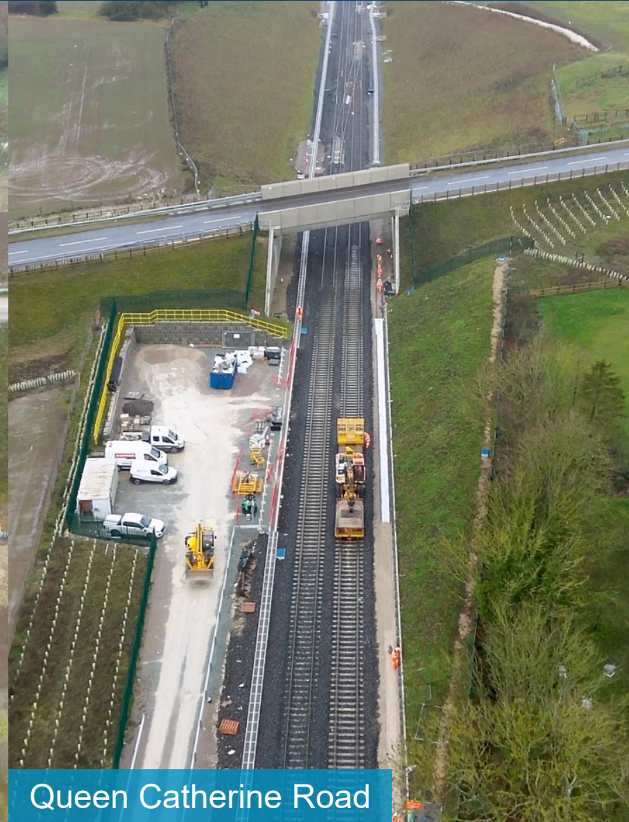
Queen Catherine Road