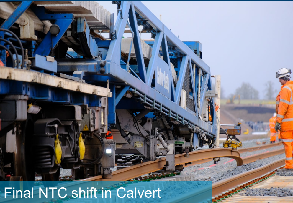
Final NTC shift in Calvert