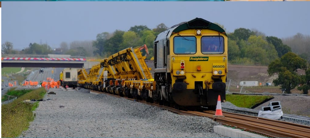
Tilting wagons in Calvert (HS2) Area