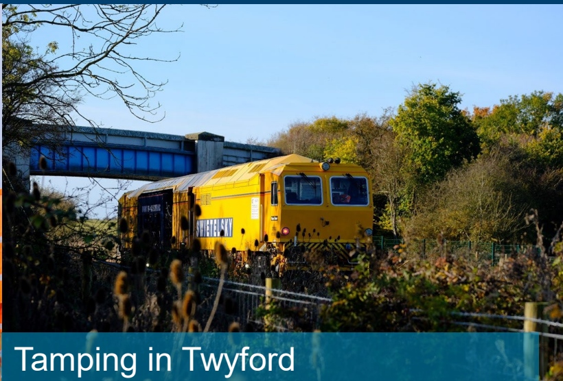
Tamping in Twyford