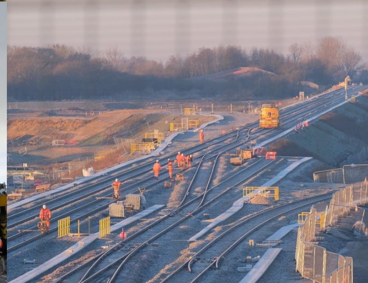
Claydon West Junction (HS2)